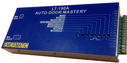
MOTOR LOGIC CONTROLLER