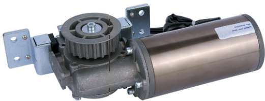
24VDC 100W BRUSHLESS MOTOR