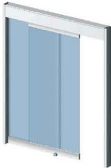
VF-50S (SINGLE DOOR PANEL)